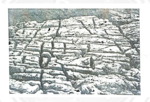
SHEET JOINTS IN ROCKS