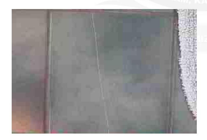
Tile Floor Inspection, Diagnosis, Repair

See WOOD FLOOR DAMAGE REPAIR for details of types of damage to wood flooring and for a description of wood floor repair approaches.