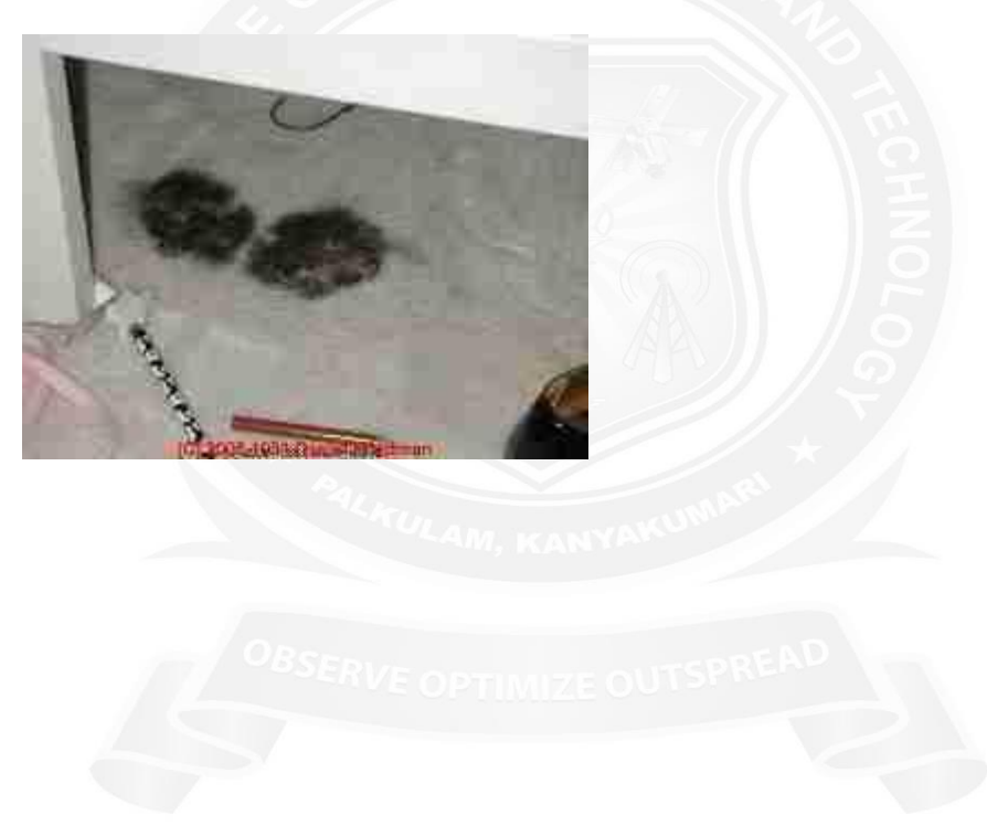
Wall-to-wall Floor Carpeting Inspection, Diagnosis, Repair

More Places to Look for Hidden Mold in buildings includes a discussion of how even a slight slope in a tile bathroom floor leads to bath leaks under and behind bathroom vanity cabinets and floor trim, and we discuss how to prevent this problem