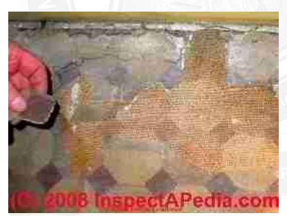
Sheet Flooring Materials That Indicate Age of a Building

Here is a photograph of an early (pre-vinyl) continuous floor covering, 1900, in an 1840 historic Vermont house.