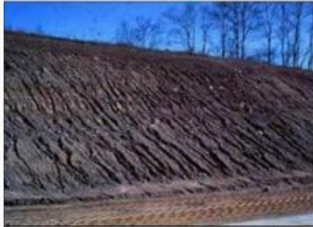
Fig. 4. Rill erosion.

c) Rill Erosion: This type of water erosion is formed in the cultivated fields where the land surface is almost irregular. As the rain starts, the water tends to accumulate in the surface depressions and begins to flow following least resistance path. During movement of water large amount of soil particles are eroded from the sides and bottom of the flow path, which are mixed in the flowing water. This surface flow containing soil particles in suspension form moves ahead and forms micro channels and rills (Fig. 4).