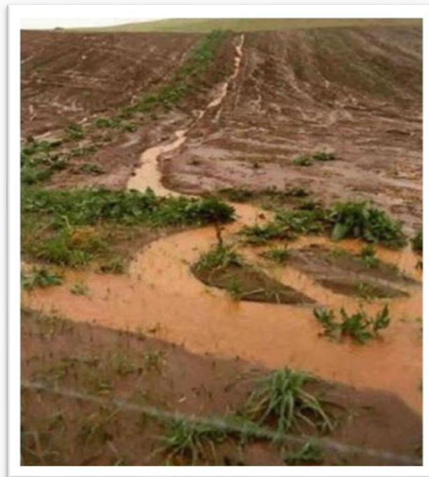
Fig. 3. Sheet erosion.

b) Sheet Erosion: Sheet erosion may be defined as more or less uniform removal of soil in the form of a thin layer or in “sheet” form by the flowing water from a given width of sloping land (Fig. 3). It is an inconspicuous type of soil erosion because the total amount of soil removed during any storm is usually small. In the sheet erosion two basic erosion processes are involved. First process is the one in which soil particles are detached from the soil surface by falling of raindrop and in the second one the detached soil particles are transported away by surface runoff from the original place. The detached process is referred to as the splash erosion and transportation of detached particles by flowing water is considered as the wash erosion. When the rate of rainfall exceeds the infiltration rate of the soil, the excess water tends to flow over the surface of sloping land. This flowing water also detaches soil particles from the land surface and starts flowing in the form of thin layer over the surface. The erosion during these processes is called sheet erosion. The eroding and transporting power of sheet flow depends on the depth and velocity of flowing water for a given size, shape and density of soil particles. Soil and Water Conservation Engineering 23 www.AgriMoon.com