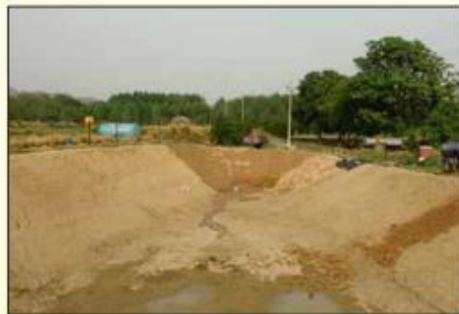
Construction of farm pond

Selection of suitable site for the pond is important as the cost of