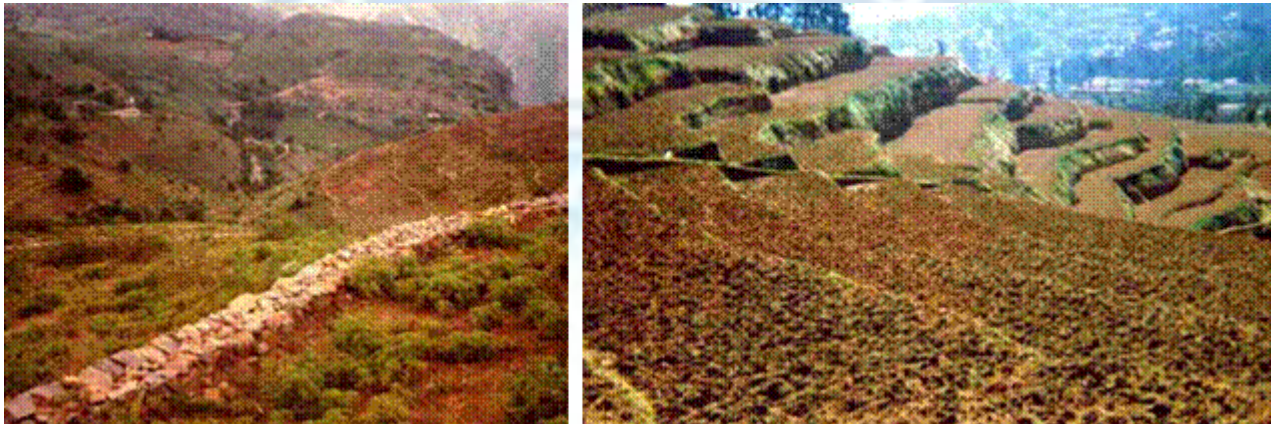
Contour trenches and stone walls