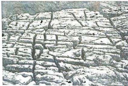
SHEET JOINTS IN ROCKS