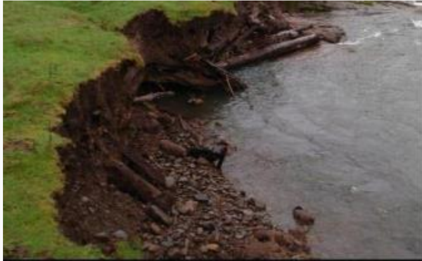
Fig. 2. Stream bank erosion