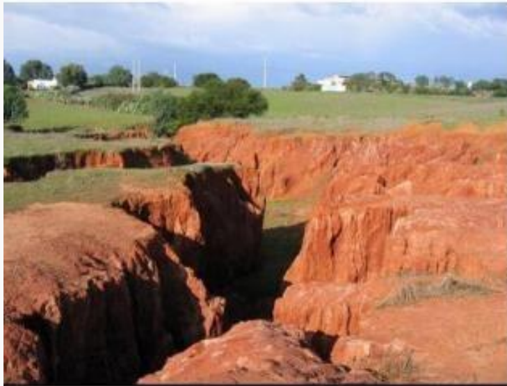
Fig. 1. Gully erosion.

1.41 Gully Erosion: Rills are small in size and can be leveled by tillage operations. When rills get larger in size and shape due to prolonged occurrence of flow through them and cannot be removed by tillage operation, these are called gullies (Fig. 1). Large gullies and their network are called ravines. It is the advanced and last stage of water erosion. In other words it is the advanced stage of rill erosion. If the rills that are formed in the field are overlooked by the farmers, then they tend to increase in their size and shape with the occurrence of further rainfall. Some of the major causes of gully erosion are: steepness of land slope, soil texture, rainfall intensity, land mismanagement, biotic interference with natural vegetation, incorrect agricultural practices, etc. Gully erosion gets initiated where Soil and Water Conservation Engineering 24 www.AgriMoon.com the longitudinal profile of an alluvial land becomes too steep due to sediment deposition. Gullies advance due to the removal of soil by the flowing water at the base of a steep slope, or a cliff at the time of fall of stream. High intensity of flow of the runoff increases the gully dimensions. In the absence of proper control measures, slowly the gullies extend to nearby areas and subsequently engulf the entire region with a network of gullies of various sizes and shapes.