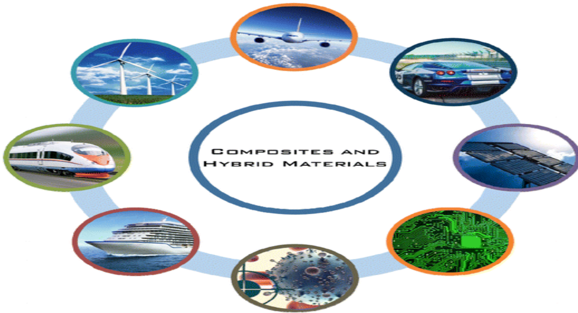
Fig-2-Applications of Hybrid composites